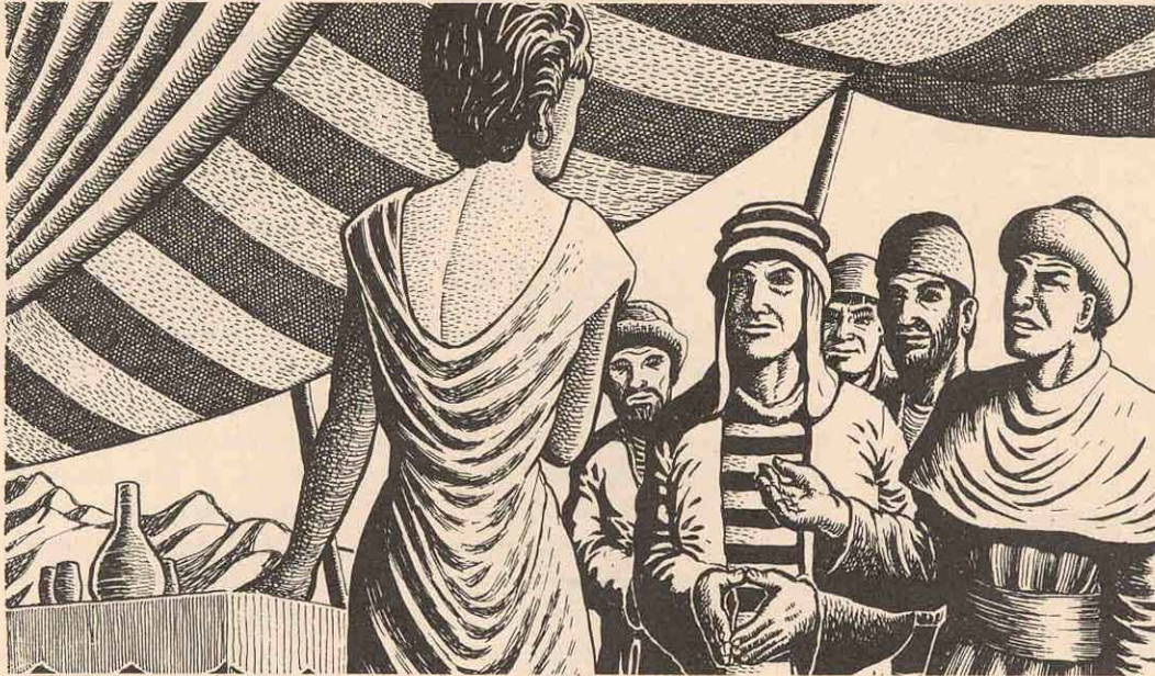
The five rulers of Philistia sent five men to pay her for the secret of Samson's strength.

The agents were a bit taken aback by this statement, but at the same time they were relieved that they wouldn't have so much to explain.