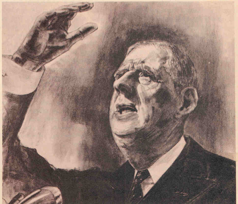
"I Am France!"

"The once world-girdling French empire has pulled one of history's fastest disappearing acts," the New York Journal-American wrote on March 24, 1962. "For most of the first half of this century, the Tricolor flew over sizeable and valuable chunks of all the continents. Its domain was in every sense a close rival of Britain's far-flung