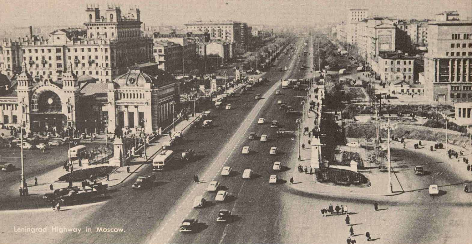
Leningrad Highway in Moscow.