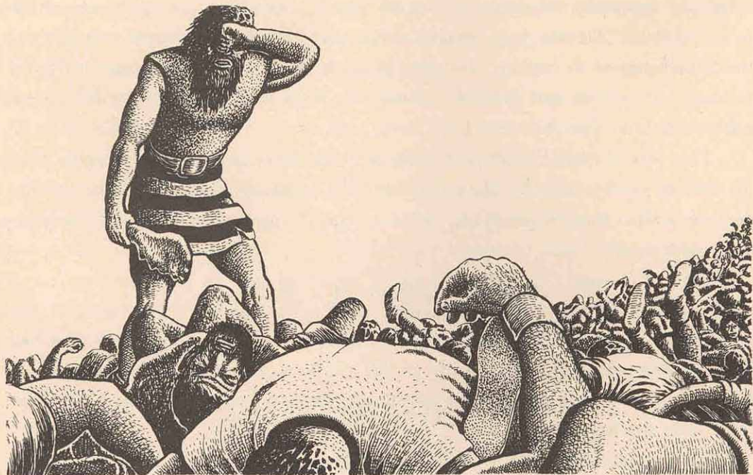
Samson realized that God had helped him overcome the hundreds of soldiers heaped about him.

It was a ragged, sweating, weary Danite who looked warily about for more Philistines to rush in. He was breathing hard after his long, fatiguing struggle. He listened for the approach of more attackers, but the only sounds were the groans