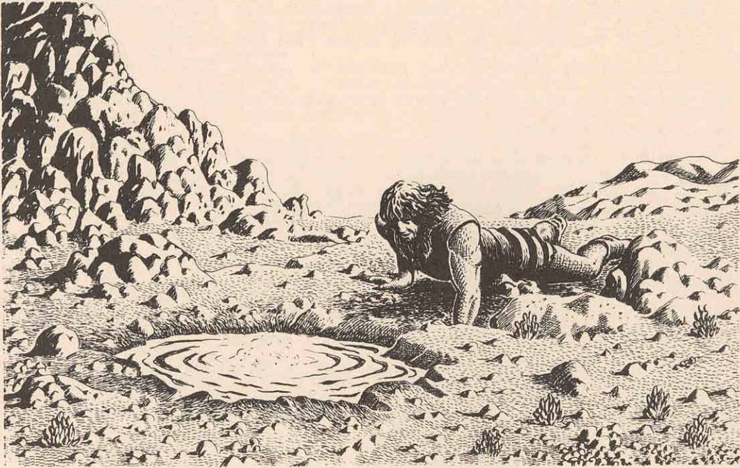
Samson slowly and laboriously crawled to the pool of water that had sprung miraculously from the dry ground.

his unusual strength. They decided to leave him alone until some circumstance favorable to them would result in his death.