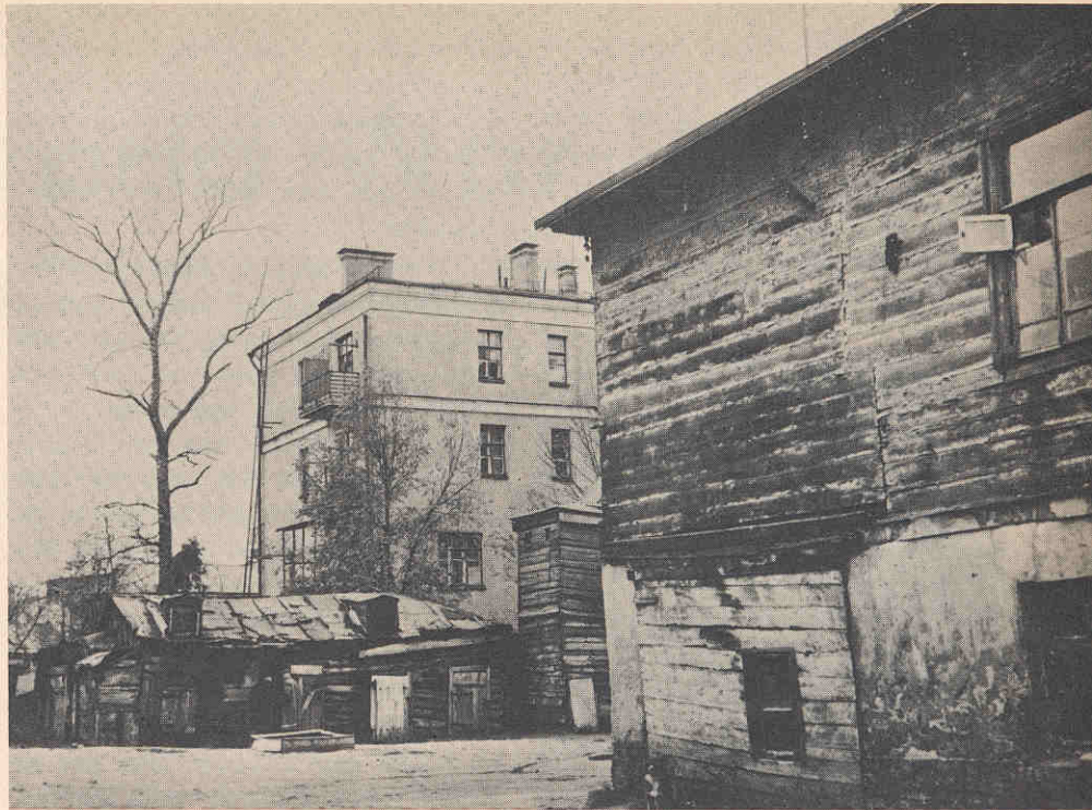
In their ambitious housing schemes, the Soviets are seeking to erase such slums as this one.

This income may be only $70 per month for those on the low end of the